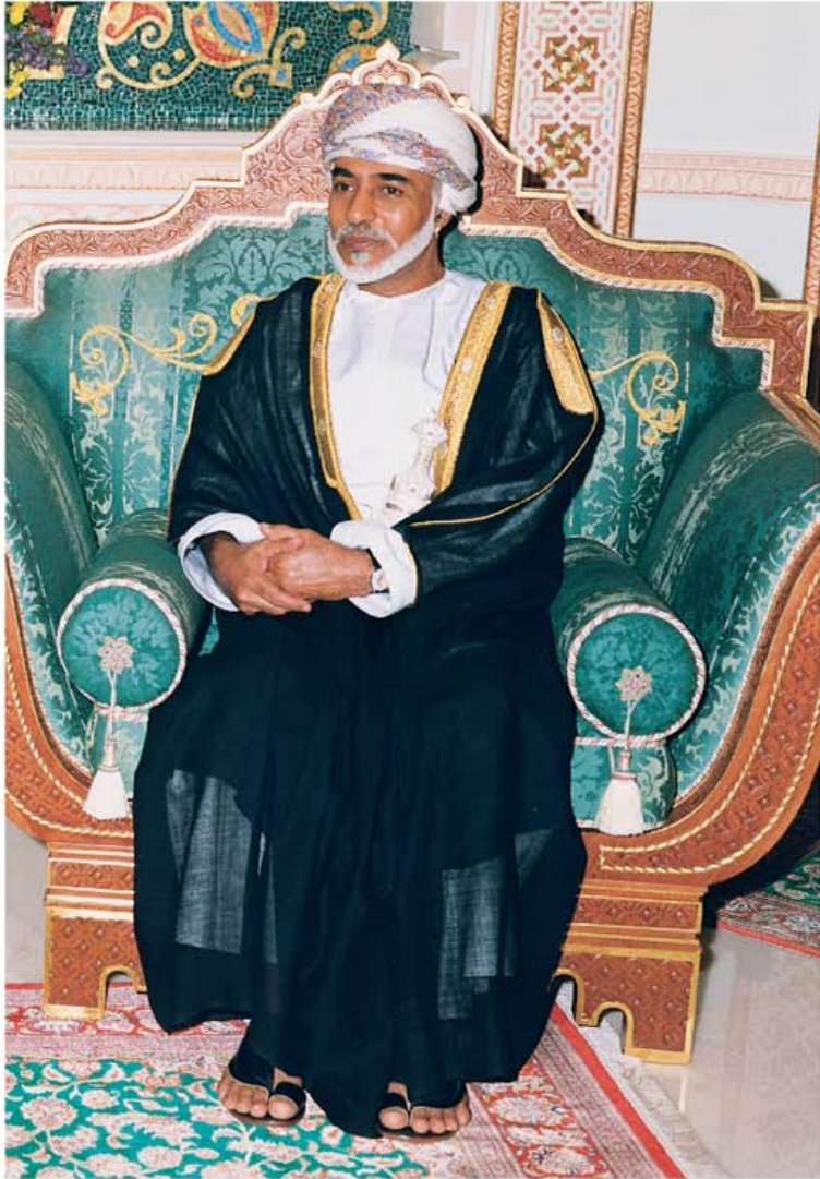
His Majesty Sultan Qaboos Bin Said